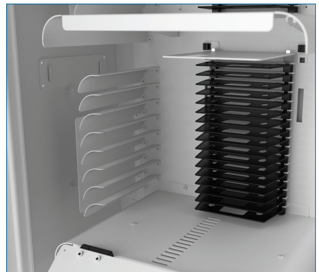
Optical Splice Enclosure OSE-HD0 Lower Splice Organizer | Photo CRR3455