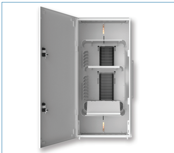
Optical Splice Enclosure OSE-HD0 | Photo CRR3457

Each universal OSE features a full range of capabilities for wall 23-in rack and T-slot mounting. The T-slot mounting hardware allows for both horizontal and vertical mounting and enables tight, side-by-side mounting arrangements. In addition, universal OSEs are especially well-suited for installations that require preconnectorized cable assemblies or stubbed optical patch panels. In these installations, the Universal OSE can actually replace the rack-mounted splice unit typically required.