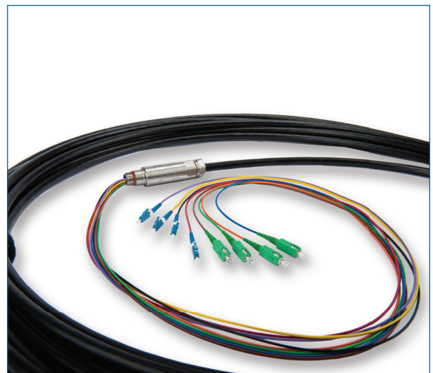
CATV Node Assembly | Photo CRR4125