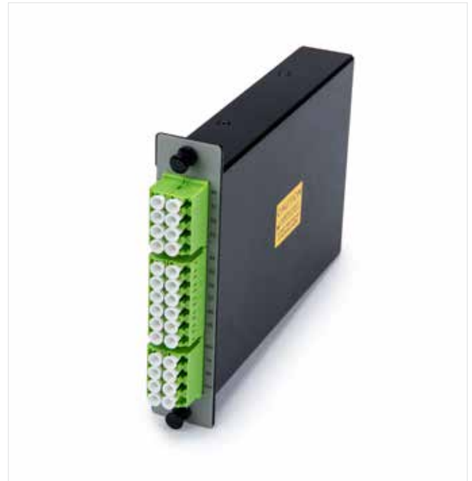
Part Number: DKXB31A204000ZZB50

Corning offers a variety of DWDM modules compatible with the LDC family connector housings. Components are compliant to Telcordia requirements, including GR-1209, GR-1221, and others as appropriate to the specification. The modules are routed directly to the LDC family housing.