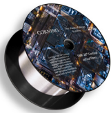
SMF-28 Contour, 190 μm