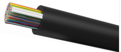
MiniXtend Ribbon Cable-200 Flow (96, 144, 192, 288, 864)