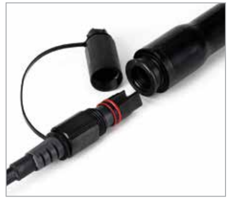
Figure 1: Difficult and time-consuming splicing becomes as simple as plug and play with pre-connectorised solutions.